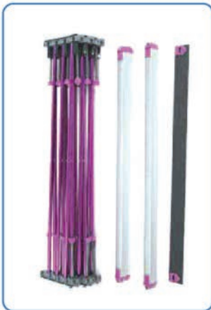
Kit includes: pop-up frame, magnetic bars and graphic panels with hangers.