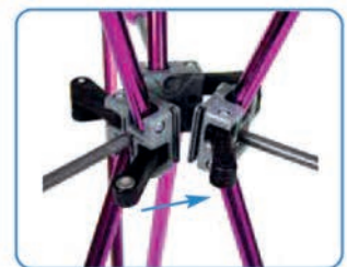
Fasten the sides together by closing each magnetic arm in the centre of the pop-up tower.