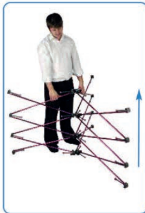
Lift the top of the pop-up frame to expand the structure, ensure the nodes are at the top of the structure.