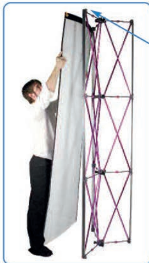
Locate the hooks on the hanger to each node and hook into place.