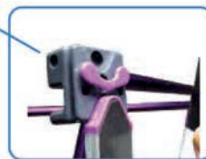
In order to position the panels correctly hook at the top and then line up the panel edges half way across the magnetic bars. Once fitted the panels may need to be adjusted slightly to line up perfectly.