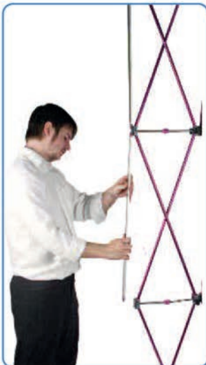
Attach the magnetic bars to the pop-up frame nodes.